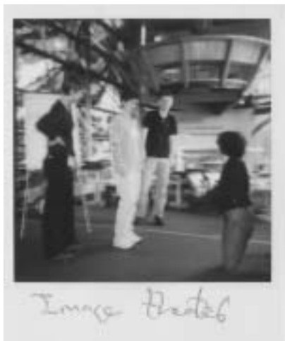
Picture from a exercise in "Image Theater". Here the aim is to let the participants tell about bad experiences related with their hearing problems - this is then enacted twice - onces ss it happened and onces as it could have been if there was no dicrimination of people with hearing disabilities. This makes it possible to dicuss how to get from the bad situation to a more ideal situation.

In the last two days of the study session the participants were given the task of designing different types of campaigns and examples of PR-events. One group had e.g. to consider how a youth organisation can design an internet homepage (see p. 11), so that the target groups - in this case young hard of hearing people looking for information about the organisation and also people interested in learning more about the impact of a hearing disability - can find the required information they were looking for. Another group was designing a exhibition and a third was working on how to organise a press conference.