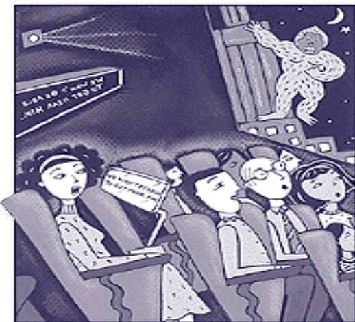
How the Rear Window captioning work.

The Rear Window technology started several months ago in USA, and it has got a good success. Since now, many cinema or theaters in the main cities are equipped with the Rear Window technology, with no supplementary ticket cost for moviegoers.